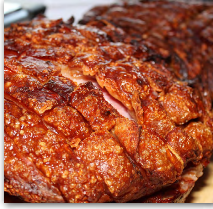
Presented at your table by our chef and accompanied by a selection of sides, this is the perfect meal to enjoy family style.

Bread Rolls - butter Cos Lettuce - parmesan dressing Steamed Seasonal Vegetables - butter Roasted Pumpkin - tahini, pepita Roasted Herb & Garlic Kipfler Potatoes Demi-Glace Gravy